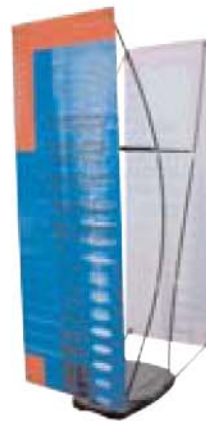
double sided banner