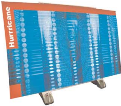
3000mm width graphic